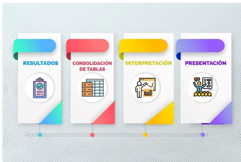
Content analysis data collection scheme

In this way, the data obtained are presented below in Table 1.