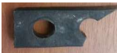
Graphic 6. Stress concentrators in blades.

"The main problems are in the geometry and the materials used" [8], in terms of geometry it could be said that the fastening holes become stress concentrators, see graph 6.