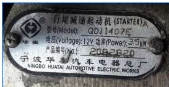
Graphic 4. Technical data of the starter motor.

Some critical aspects are considered at the time of selection such as: environmental conditions, electrical protection index (in this case it does not apply since it is direct current), installation disposition (in this case it is an adaptation and it is probable that it does not have support devices to the original base), nominal power (perhaps the most important since it must move and drag a 16HP heat engine [7]), the work cycles (relatively low since it will only influence the ignition of the tiller), rotation speed (in this aspect it is common for starters that their torque is high but their rotation speed is low), efforts and loads to do the job (the starter will not be subjected to greater efforts), there is to say that both the starter motor and the rototiller are of Chinese origin as shown in figure 4.