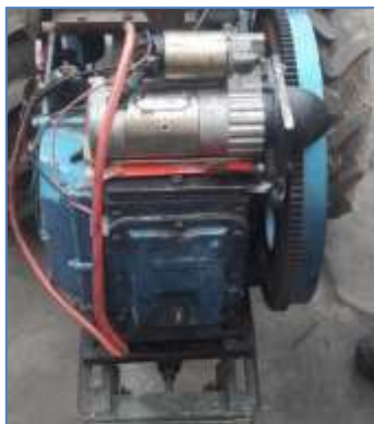
Graphic 3. Starter assembly and cogwheel of the flywheel.