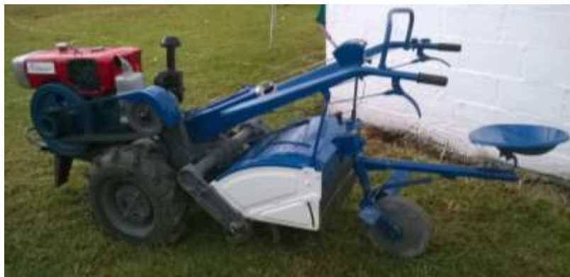
Graphic 2. Study walking tractor