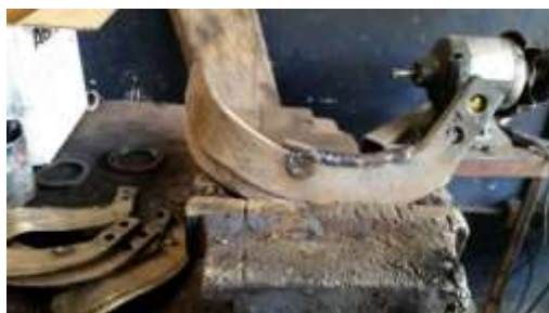
Graphic 10. Added blades material.