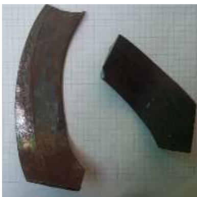
Graphic 7. Remains of an underground blade.

After fracturing the blades of the milling machine, the residues are in two parts, the first one is trapped in the milling box between two bolts and the other part remains on the ground generating two imminent risks. The first is the danger of cutting. sharp and sharp edges remain as can be seen in figure 7.