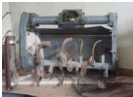
Graphic 5. Rotavator with blades

As mentioned in previous lines, another of the most pressing problems is the breaking of the blades, this problem occurs because the Chinese walking tractor was designed exclusively to till the soil destined for rice cultivation in its country of origin and therefore the benefits are different, the average hardness of the soil is totally different and the working conditions are different: while in Ecuador it has been tried to use the tiller to break the firm soil and more or less humid the other side of the coin is in China where these machines are used to prepare the soil with a view to planting rice. The farming organ with which the producer exports is the classic "rotavator" or known in Spanish as a floor milling machine or simply a milling machine, you can see its appearance in figure 5.